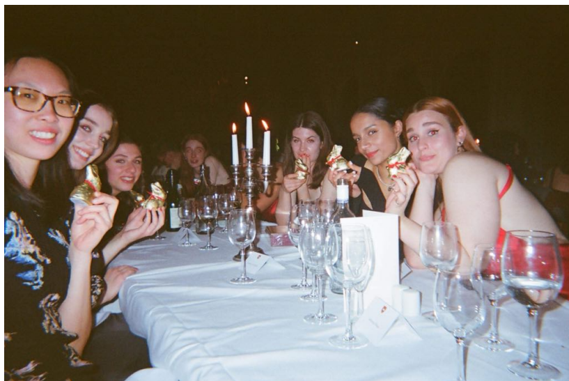
W1 celebrate Blades! – Torpids 2023