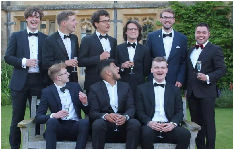
O1 – Summer VIIIs 2023