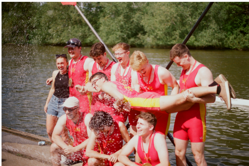
O1 celebrating a row on every day in Summer VIIIs 2024