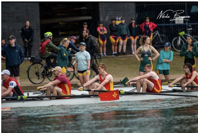
O1 – Summer VIIIs 2024

in Hilary our coach told me that I would race in the first boat at Torpids. Unfortunately, Torpids was cancelled. I was really disappointed that I could not race, but it motivated me to work even harder. As a result, I got my shot in Trinity.